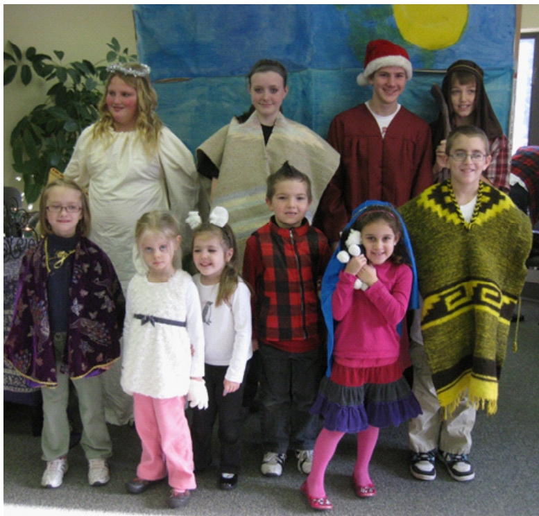
Participants in "The Scottish Shepherd's Story" performed by children in the RE program on December 18, 2011.